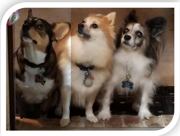
Our dogs: Lulu, Roxy, Pappy