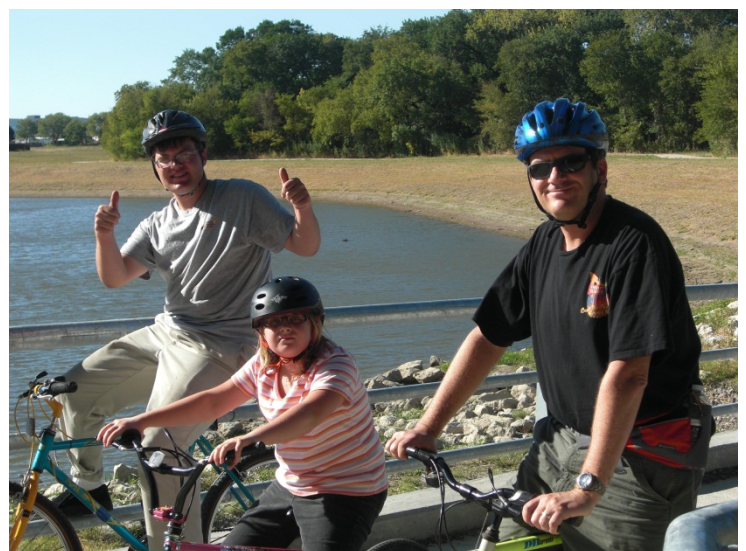
Family Bike Ride