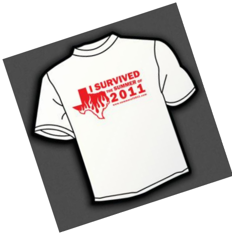
Summer 2011 t-shirt

Additional Photos for your viewing pleasure (or pain):